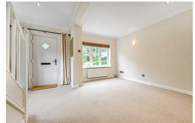
Corner Cottage, 18 Meredun Close | £385,000 Hursley, Winchester, Hampshire, SO21 2JB